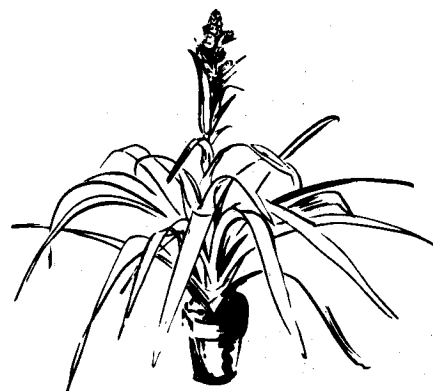
Guzmania zahnii (Colombia, Panama)