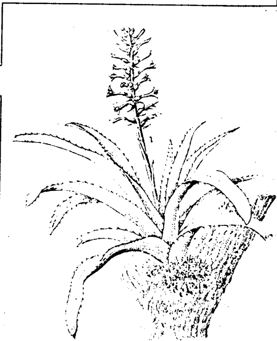
AECHMEA DRAKEANA, Ed. André.

5 Drakeana. The famous Ecuadorean plant found by André in the 1880's. Graceful 14" plants with slightly undulated leaves greyed with whitish scales. The erect spike and flower cups a beautiful lacquer-red, a striking contrast to the sky-blue petals. A must for every collector. $ 6.50