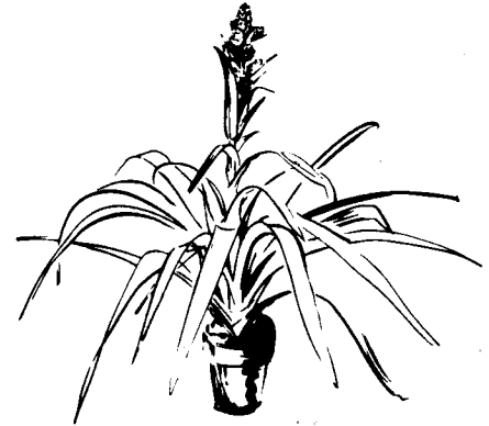
Guzmania zahnii (Colombia, Panama).