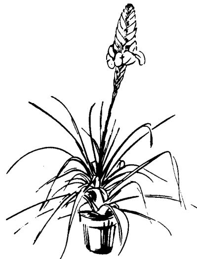
Tillandsia lindenii var. caeca .

lindenii var. caeca . Peru. (The varietal name means blind, i. e., without a white eye.) Attractive formal rosette of recurved linear channeled leaves green with red-brown pencil lines becoming more prominent toward base; inflor. a long spike of flattened carmine-rose bracts with large royal-blue flowers of expanded open petals. 3.50