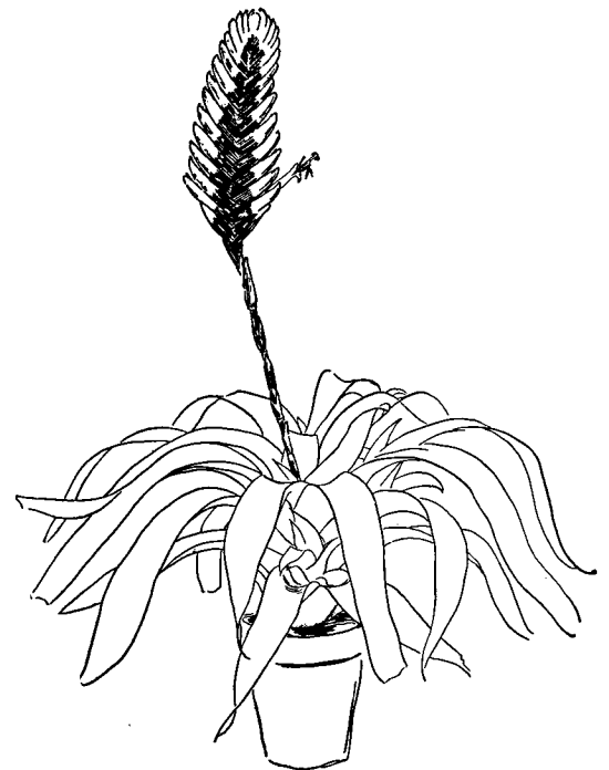
Vriesea x ' Mariae .' The Painted Feather. A European-made hybrid between V. Barilletii and V. carinata . Many light green leaves in a full rosette. The tall spike is flattened to show bracts shading from a center section of red to chartreuse-yellow at the edges. The flowers are bright yellow tubes. Colorful for months. $4.00 In spike $5.00