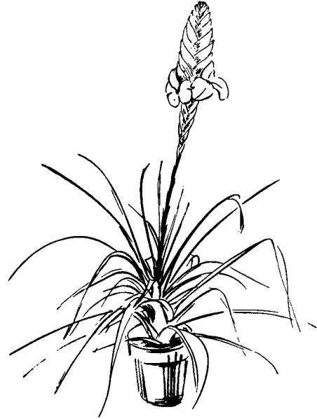
Tillandsia lindenii var. caeca . (The varietal name means blind, i.e., without a white eye.) *Attractive formal rosette of recurved linear channeled leaves green with red-brown pencil lines becoming more prominent toward base; inflorescence a long spike of flattened carmine-rose bracts with large royal-blue flowers of expanded open petals. $3.50. In spike $5.00.