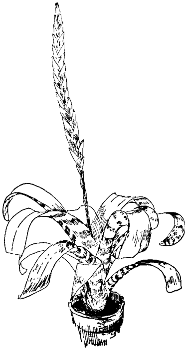
Vriesea splendens . (B. Guiana). The Flaming Sword.* Leathery rosette of slender bluish-green leaves marked with broad purple crossbands; underneath grayish with purple bands very bold; flower spike long and sword-shaped with flattened fiery-red bracts and yellow flowers. $5.00