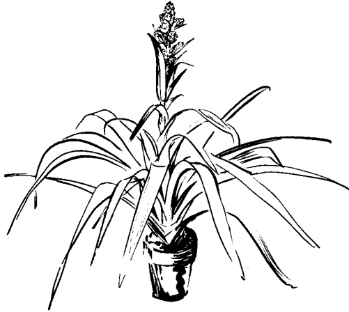
Guzmania zahonii (Colombia, Panama).* Very ornamental plant with stripe-like, papery, olive-green leaves pencil-stripped maroon-red, the center tinted pink to coppery red; strong-branched inflorescence with pink to yellow bracts and white flowers. .... 5.00